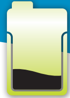
SAFE-Tank® SYSTEMS – STORAGE & CONTAINMENT